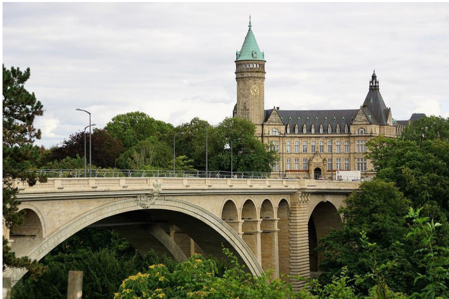
The Adolphe Bridge in Luxembourg City

Luxembourg City is the capital city of the Grand Duchy of Luxembourg (also named „Luxembourg“), and the country's most populous commune. Standing at the confluence of the „Alzette“ and „Pétrusse“ rivers in southern Luxembourg, the city lies at the heart of Western Europe, situated 213 km by road from Brussels, 372 km from Paris, and 209 km from Cologne. The city contains Luxembourg Castle, established by the Franks in the Early Middle Ages, around which a settlement developed.