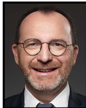
Georges ENGEL Minister of Sport