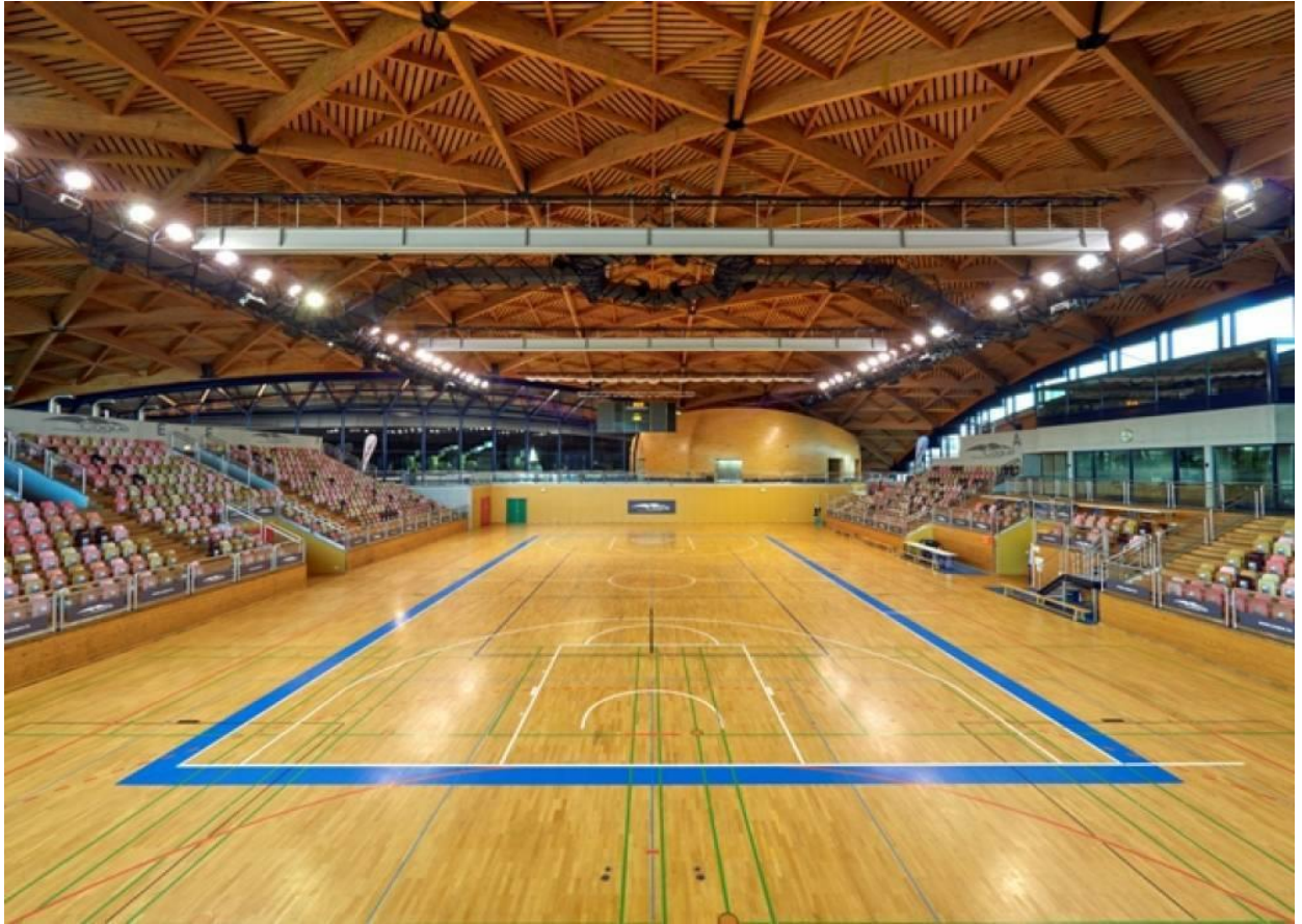
The Gymnase in the Coque

The warm up area is situated in a part of a multi-purpose area of 1.400 square meter which is divisible into three parts.