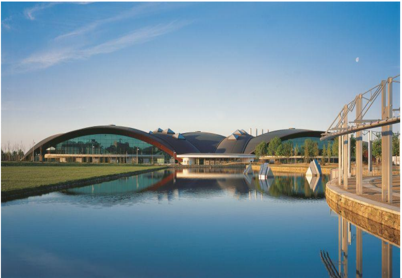
Outside view of d'Coque in Kirchberg

In 1982, first the olympic swimming pool opened its doors. The striking shell- shaped roofline is reminiscent of a seashell, and is made of spans of pre-stressed concrete. With the swimming pool extension undertaken by architect Roger Taillibert in 2002, the Centre National Sportif et Culturel was created.