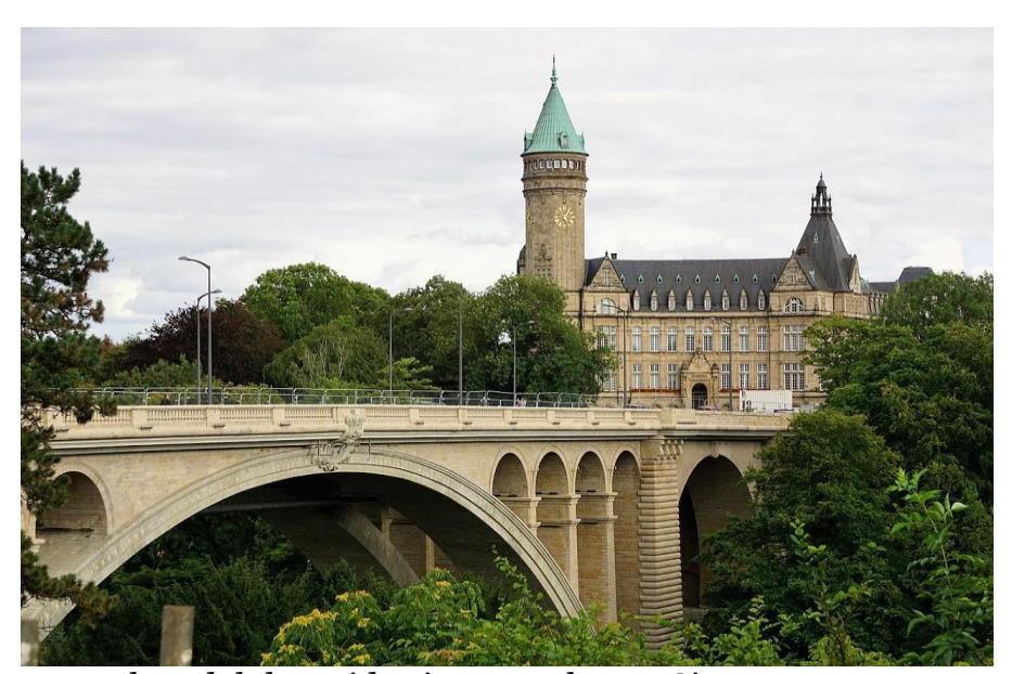
The Adolphe Bridge in Luxembourg City

Luxembourg City is the capital city of the Grand Duchy of Luxembourg (also named "Luxembourg"), and the country's most populous commune. Standing at the confluence of the "Alzette" and "Pétrusse" rivers in southern Luxembourg, the city lies at the heart of Western Europe, situated 213 km by road from Brussels, 372 km from Paris, and 209 km from Cologne. The city contains Luxembourg Castle, established by the Franks in the Early Middle Ages, around which a settlement developed.