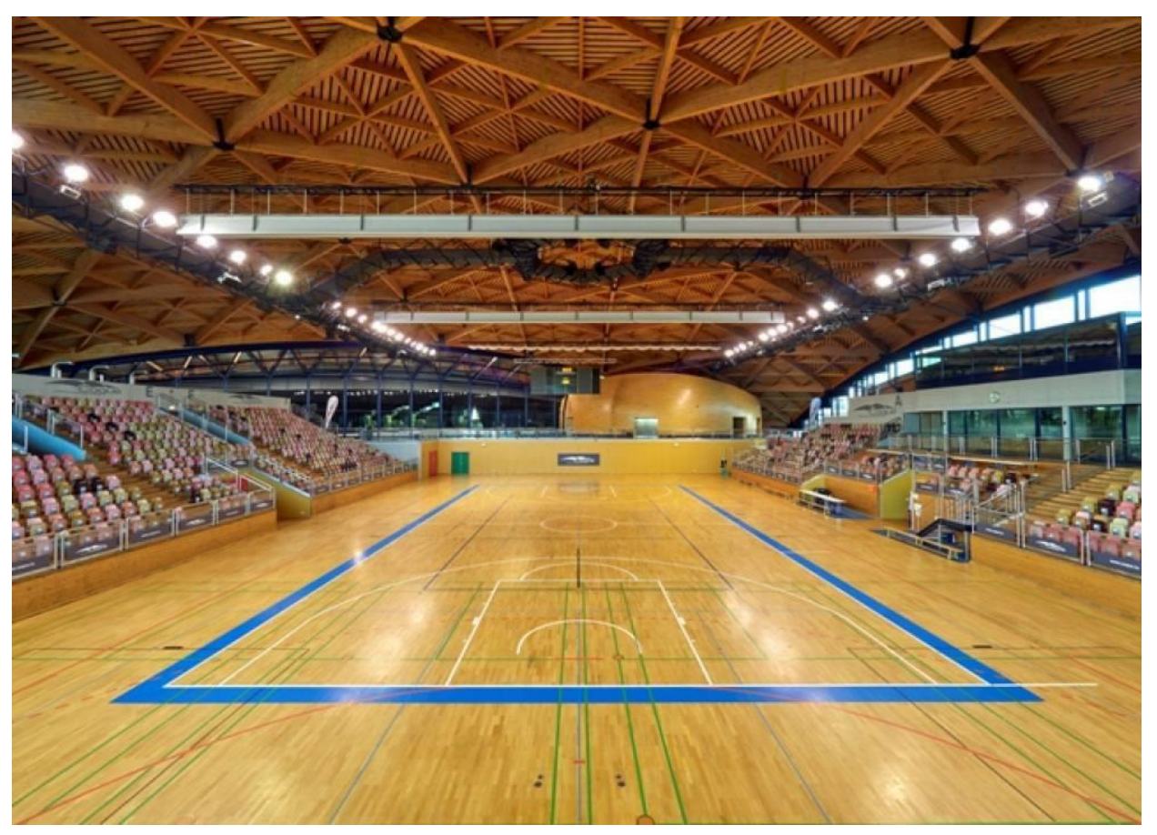
The Gymnase in the Coque

The warm up area is situed in a part of a multi-purpose area of 1.400 square meter which is divisible into three parts.