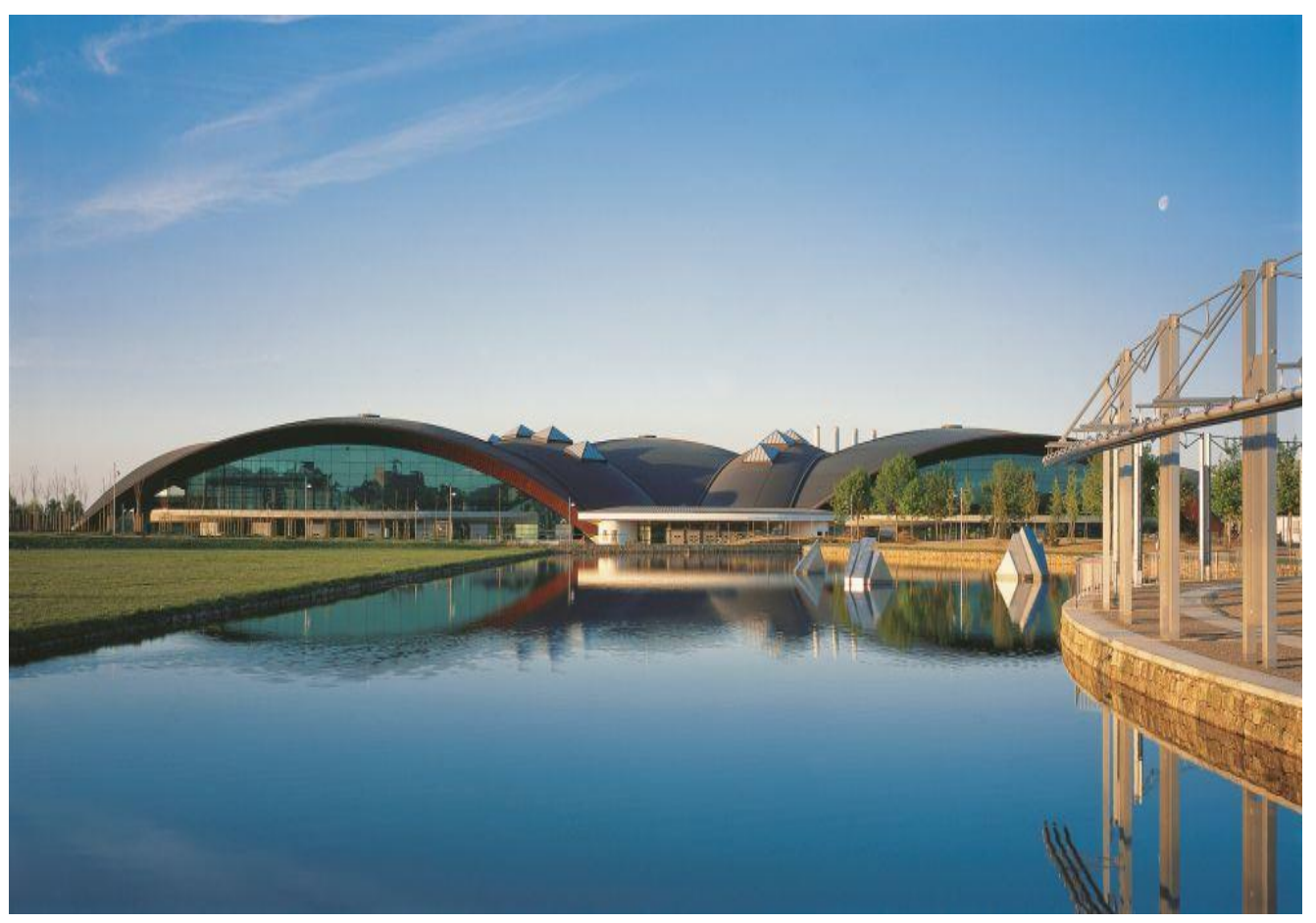
Outside view of d'Coque in Kirchberg

In 1982, first the olympic swimming pool opened its doors. The striking shell- shaped roofline is reminiscent of a seashell, and is made of spans of pre-stressed concrete. With the swimming pool extension undertaken by architect Roger Taillibert in 2002, the Centre National Sportif et Culturel was created.