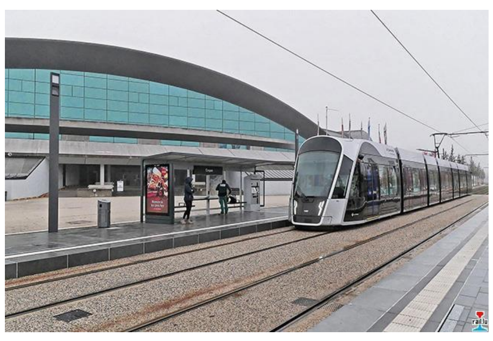
Le tram stand at the Coque

Example given from all the hotels close to the airport (pages 14-16) the sports hall Coque can be reached in about 20 minutes by taking bus N° 18 and then the tram (Station called Coque/picture). There is only one tram line in Luxembourg. The same to get back to the hotel.