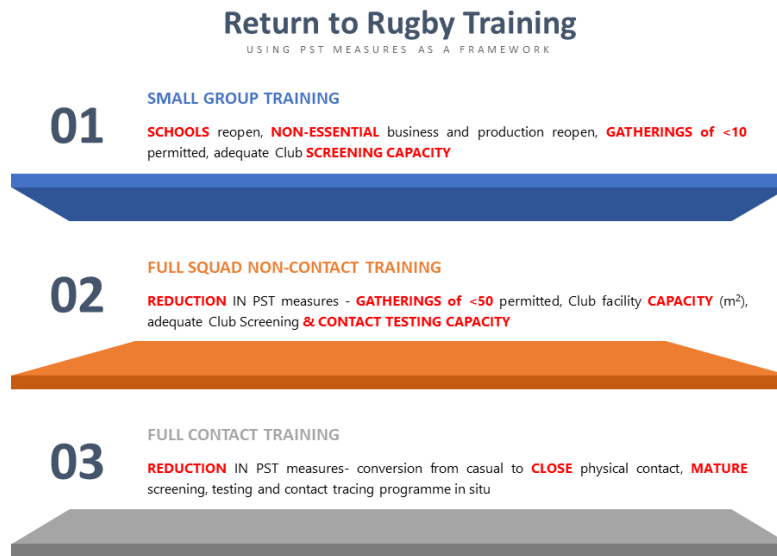
Figure 1: Return to rugby training using PST measures as a framework

Unions and Clubs will need to demonstrate an ability to comprehensively screen (temperature and symptom check), test (PCR and antibody test) and contact trace, in line with local government guidelines, during this process.